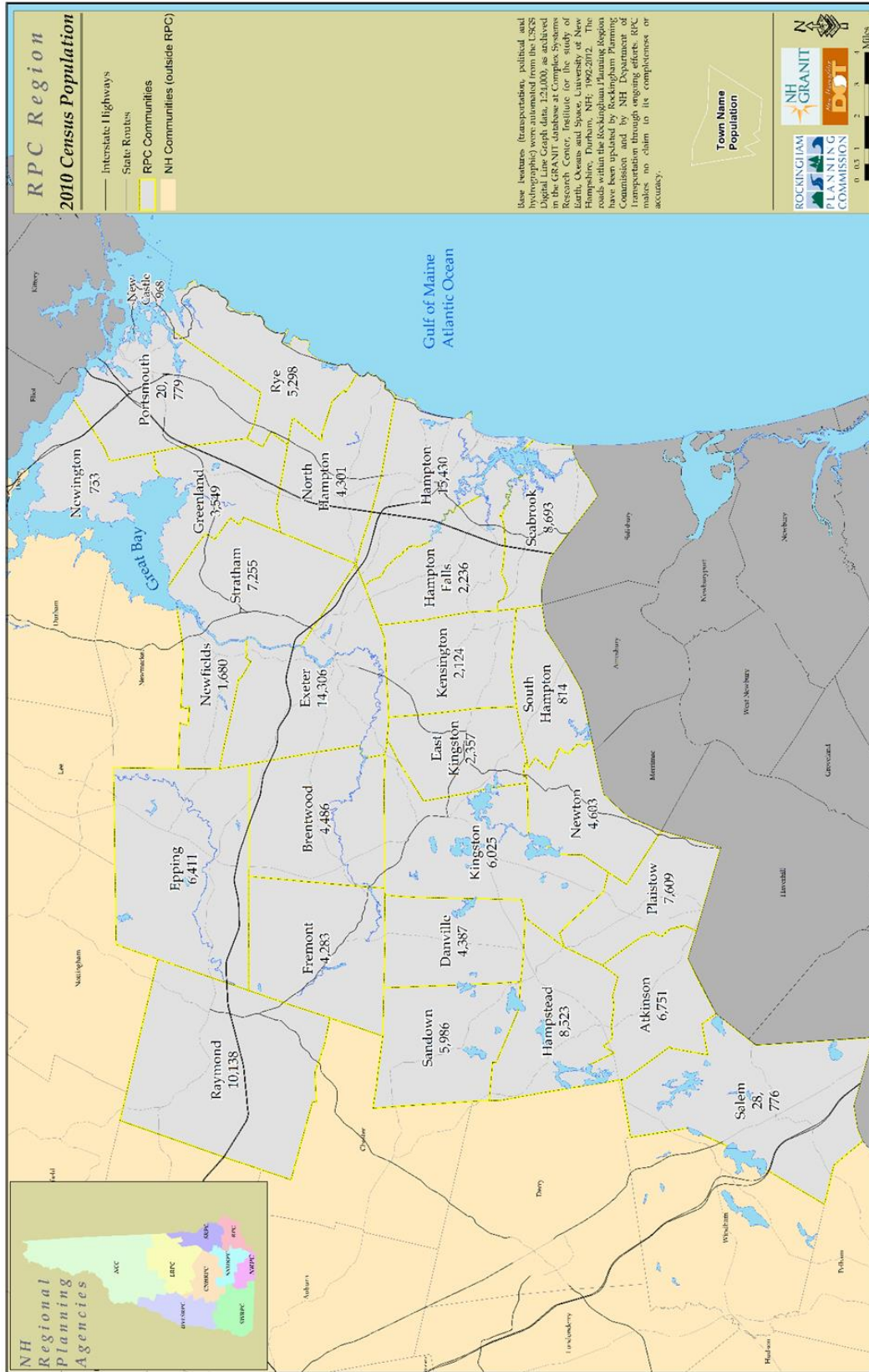
Figure 1 – RPC MPO