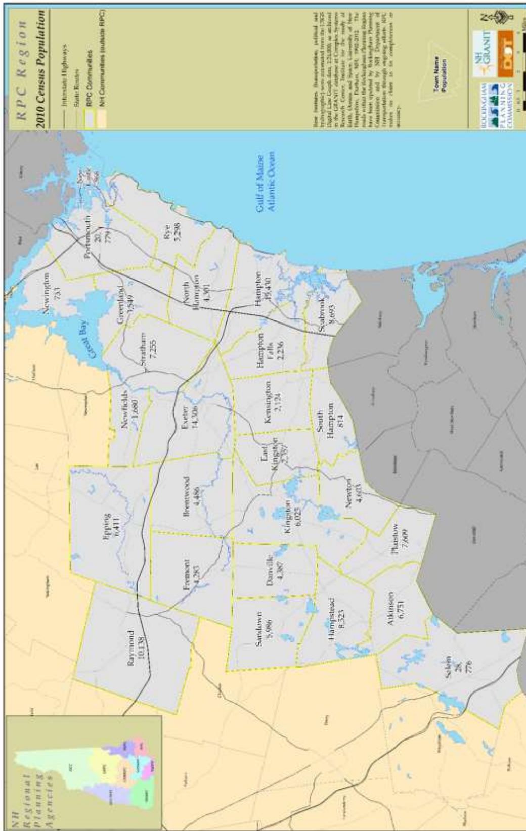
Figure 1 – RPC MPO