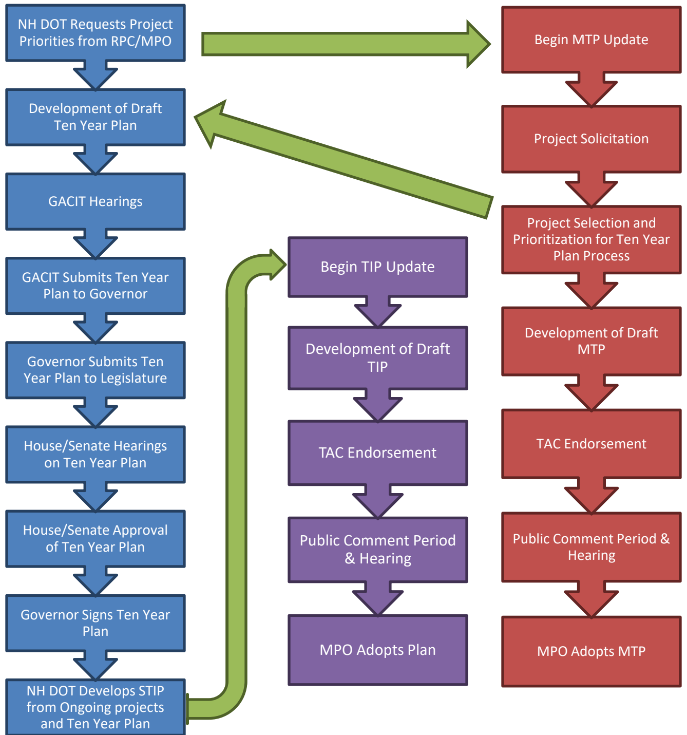
FIGURE 2: Development of the Rockingham Planning Commission 2040 Plan & 2017-2020 TIP, and State Ten Year Plan