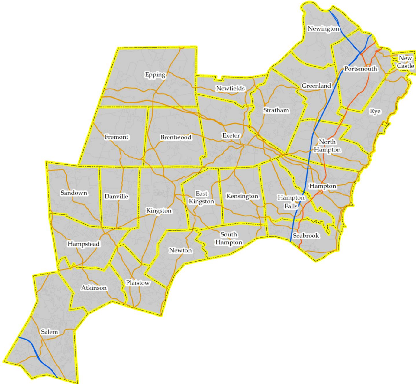
FIGURE 1: Rockingham Planning Commission Region