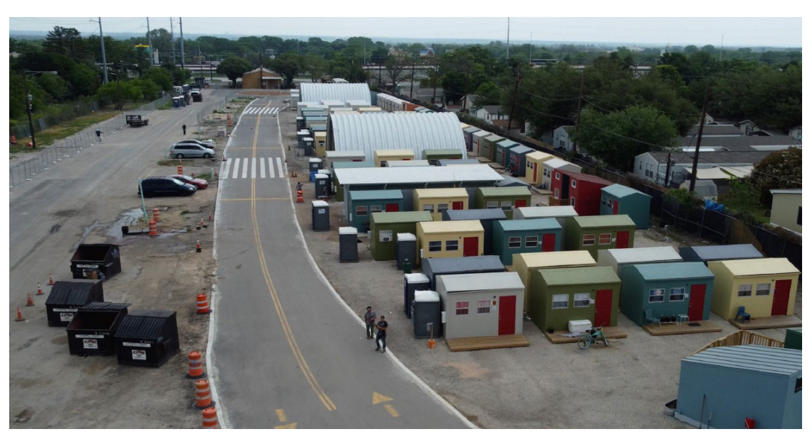
Figure 3 An aerial view of the locking, climate-controlled shelters at Esperanza Community

Recognizing that people experiencing homelessness made up 80% of fatalities and serious injuries from crashes along I-35 and that upcoming construction would displace encampments on I-35, TxDOT's Austin District recognized that it needed to come up with a meaningful and effective solution to address the needs of people experiencing homelessness. Through a coordinated approach with public, philanthropic, and private organizations, TxDOT proposed a transitional camp concept that would bridge the gap between unsheltered homelessness on the highway and ultimate permanent housing in line with a housing first approach. Leadership buy-in was achieved due to a clear transportation use case—pedestrian safety and displacements.